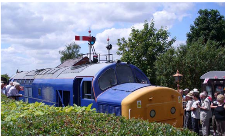
Class 37 in Mid-line livery collecting the stock

Arrival at the tiny station of Chinnor, which only fitted about half of our train in to the platform, must have been some occasion as the station area thronged with onlookers. We left the train and retired to the buffet tent (for homemade cakes), 1600 was uncoupled and moved forward into the yard, as there is no run-round loop at Chinnor station. A class 37 was moved onto the coaches and these were drawn forward into a siding, 1600 returned to the station and was watered up.