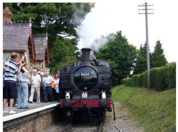
1600 watering up at Chinnor