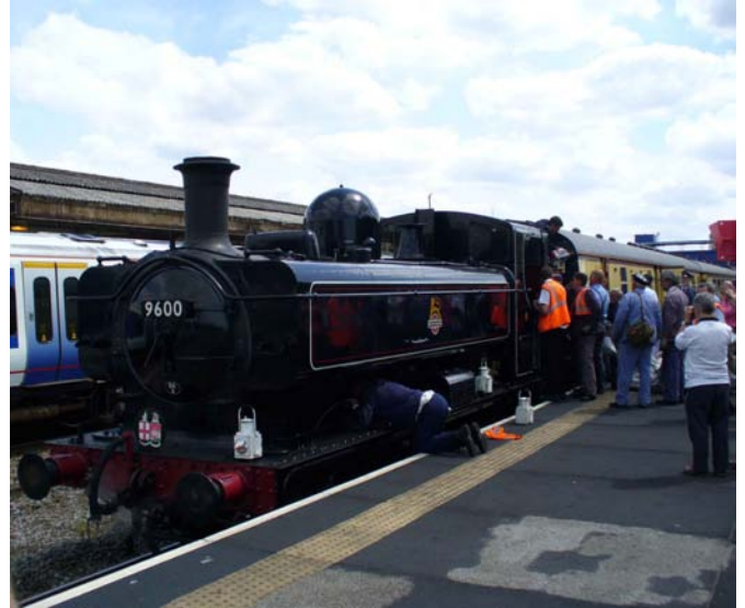
1600 being checked over ready for return run

The trip to Bicester was again at a lively speed and the line side had many photographers taking pictures and videos. On arrival at Bicester there was a short un-veiling of a plate marking the centenary of the Bicester cut-off by Adrian Shooter, chairman of Chiltern Railways.