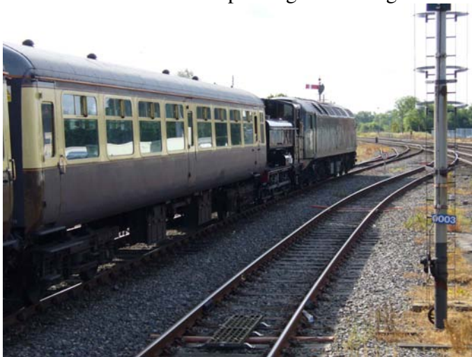
Class 47, 1600 & set in Back Road at Banbury

The Class 47 was shunted off the front of the special and the GWR Pannier (in BR Black livery) No. 1600 was watered in the sidings behind the main platforms, while we awaited the special to move over to our platform there was a succession of passenger and freight services through.