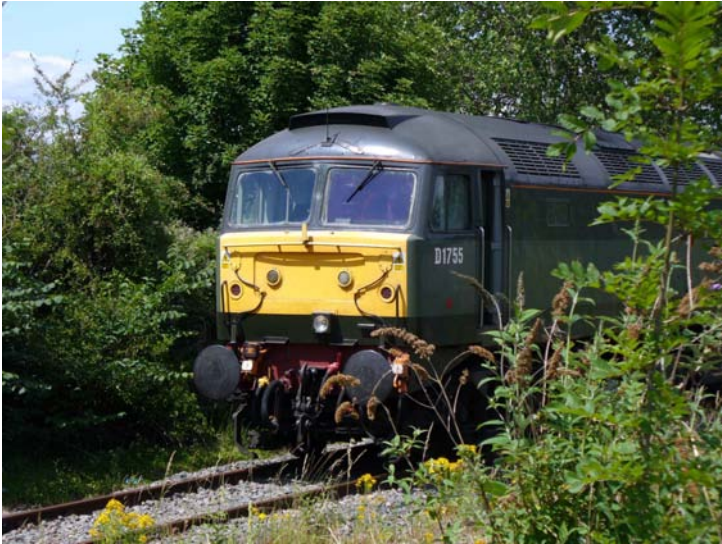
Class 47 in back loop at Princes Risborough

1600 was moved into the siding to collect the coaches and then these were drawn forward into the platform, an on-time departure was made for the trip up the branch back to Princes Risborough, where the CPRR crew left us and 1600 was run-round the stock, ready for departure back to Bicester, the class 47 left ahead of us for Banbury.