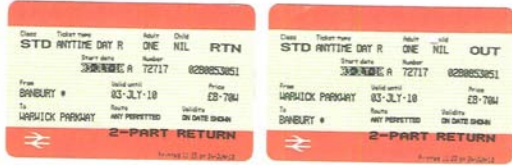
Our tickets for the journey.

On Saturday 3 rd July 201 the three 'Oldies' from the Maintenance team took time out to travel on a steam special arranged by Chiltern Railways from Banbury to Chinnor, this was in celebration of the centenary of the Bicester cut-off. The weather was ideal, a sunny and cloudless sky with a slight breeze. It was billed as a unique opportunity to travel directly to Chinnor over a temporary connection put in for the day only.