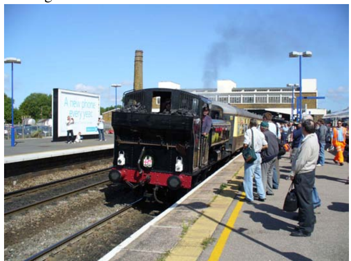
1600 and set arriving in the platform at Banbury Spot Brian H & Trevor looking on.